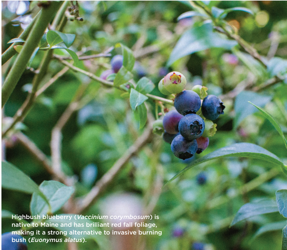
Highbush blueberry ( Vaccinium corymbosum ) is native to Maine and has brilliant red fall foliage, making it a strong alternative to invasive burning bush ( Euonymus alatus ).