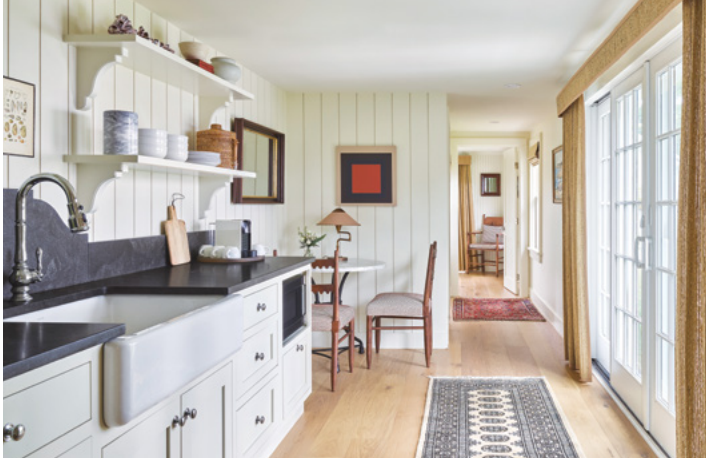
ABOVE: In the kitchen, cabinets by Atlantic Design Center and Du Chateau flooring from Distinctive Tile and Design.

Pulling up to The Dunes, right off Main Street, feels like arriving at an idyllic movie set with panoramic views of the beach dunes, colorful gardens, and the resort's delightful cottages styled to the max. Seashell covered walkways wind through the grassy property, leading to the tidal river and boat dock or the Ogunquit Lobster Pound. There, guests can get a free blueberry cobbler if they show their room key. Ogunquit center is a quick stroll down the road, and the resort provides a golf cart, bikes, and a car service for easy transport. For those looking to travel via water, a Dunes yellow-striped cabana boat can bring visitors across the estuary to the beach or to cruise around the river.